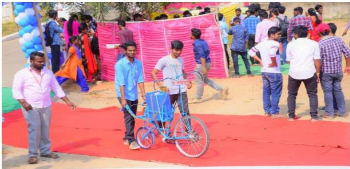
III B.Tech ME students participated in project Expo