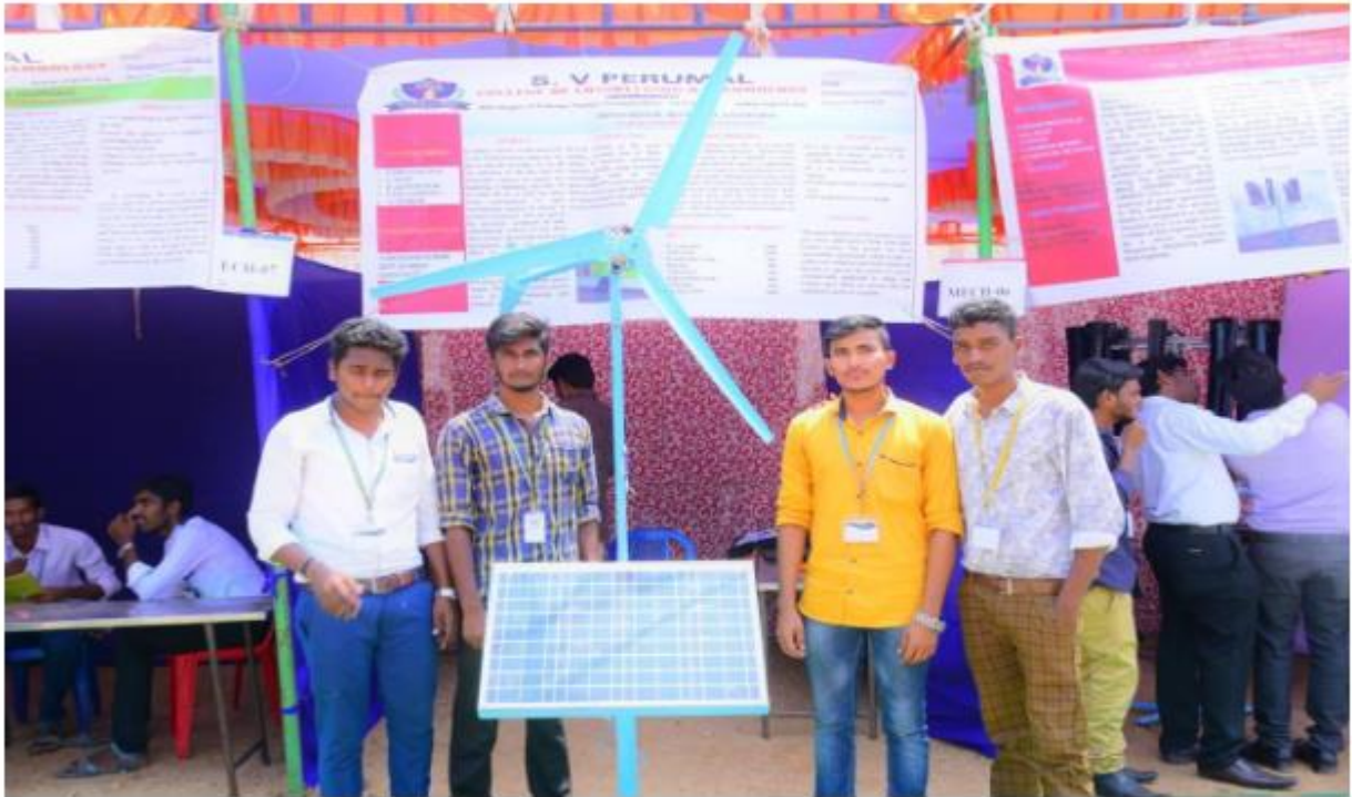
IV B.Tech ME students participated in project Expo